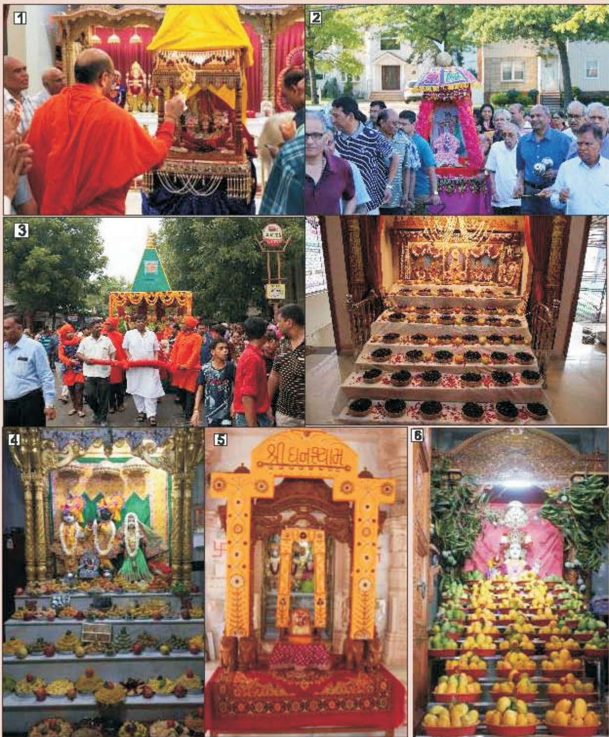
(1) Rathayatra Darshan In Parsippany (America) temple. (2) Rathayatra Darshan organized by our temple on the roads of New York. (3) Rathayatra and Jambu Utsav Darshan organized by our New Ranip temple. (4) Annakut Darshan In front of Thakorji on the occasion of Patotsav of Ayodhya temple. (5) Artistic Hindola Darshan in front of Thakorji in Mehsana temple. (6) Amrotsav Darshan in Gandhinagar Sector-2 temple.