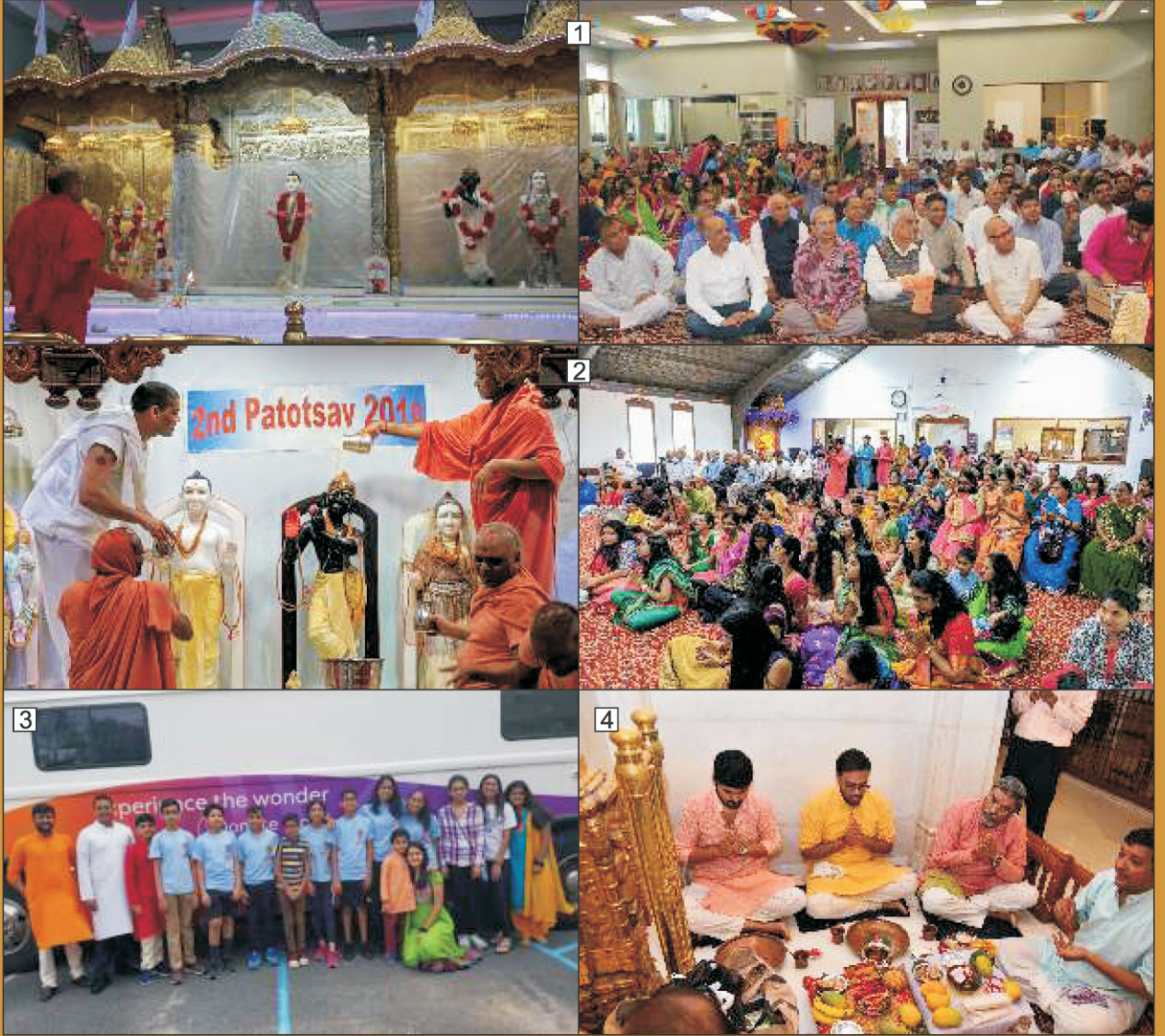
(1) Abhishek Darshan of Thakorji on the occasion of second Patotsav of Shree Swaminarayan temple, Rale (America). (2) Abhishek Darshan of Thakorji on the occasion of second Patotsav of Shree Swaminarayan temple, Parsipenny (America). (3) Volunteers at the time of blood donation camp organized by ISSO Sewa. (4) Host devotee family performing pooja on the occasion of Kesar Snan to Shree Narnarayandev in Ahmedabad temple.

Registered under RNI - No - GUJENG/2007/20198 " Permitted to post at Ahd PSO on 11 the every month under postal Regd. No. GUJ. 582/2018-2020 issued SSP Ahd Valid up to 31-12-2020