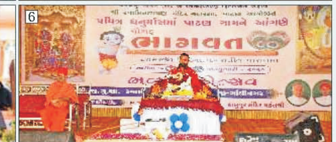
(1) H.H. Shri Lalji Mahaarj blessing the Sabha organized on the occasion of Bal Satsang Shibir in Ahmedabad wherein large number of children participated. (2) H.H. Shri Lalji Maharaj blessing the Sabha on the occasion of Vachanamrit Katha-Parayan and Vidh-vidh Abhishek in Naranghat temple and Pothi Yatra Darshan. (3) H.H. Shri Lalji Maharaj performing Shakotsav in Hirawadi. (4) Vachanamrit Ratriya Parayan and Shakotsav in Motera village. (5) Shakotsav at village Kocharab. (6) The spokesperson narrating Bhagwat Katha at village Patan.