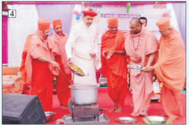
(1) H.H. Shri Acharya Maharaj performing Murtipratistha and granting blessings in the Sabha in Marusana temple. (2) H.H. Shri Acharya Maharaj performing aarti of Thakorji on the occasion of Patotsav of Vasant Panchmi of Muli temple. (3) H.H. Shri Acharya Maharaj performing Shakotsav in Manekpur (Chaudhary) temple. (4) H.H. Shri Acharya Maharaj performing Shakotsav in Moti Aadraj temple. (5) The host devotee family performing aarti of H.H. Shri Acharya Maharaj on the occasion of Katha Parayan at village Bhayala.