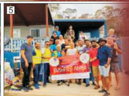
(1) Saints and Haribhaktas performing Shakotsav in our Sine Mansion (America) temple. (2) Saints narrating Katha of Shiksha Patri Jayanti on the pious day of Vasant Panchmi in Chicago temple. (3) Saints and Haribhaktas performing Shakotsav in Regina (Canada) temple. (4) Shakotsav in our Saskatoon (Canada) temple. (5) Assistance by our I.S.S.O. SEWA to the people affected during the severe forest-fire in Australia.