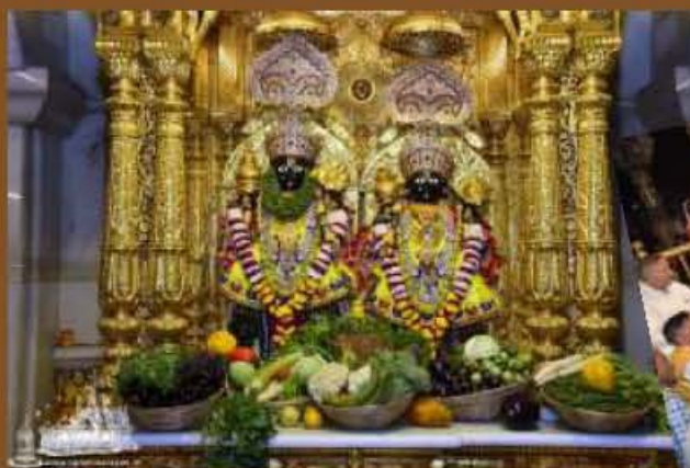
Five Aarti and Auchhav for the whole night in front of Shree Namanayandev performed by Auchhav Mandal on the pious day of Dev Prabodhini Ekadashi.