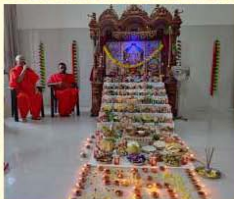
Kota Annakut Darshan