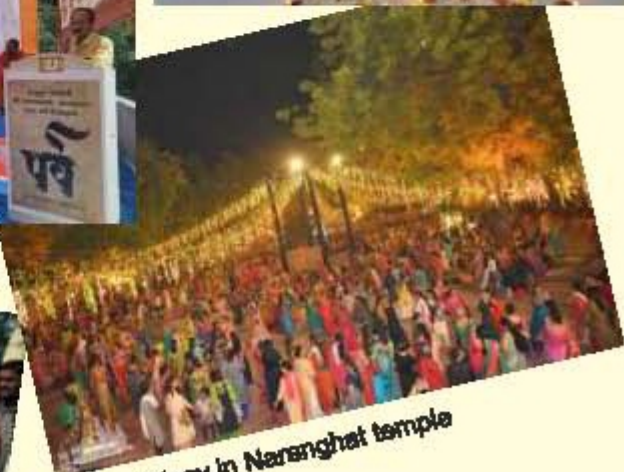
Sheradotsav in Naranghat temple