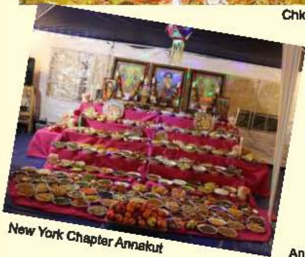
New York Chapter Annakut