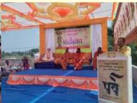
Patotsav Sabha at village Limda Muvada