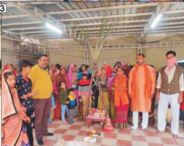
(1) Dhanur Maas Darshan in Naranpura temple.(2) Abhishek of Thakorji and Annakut Darshan of Thakorji on the occasion of Patotsav of Gandhinagar temple (Sector-2). (3) Annakut Darshan, Bal Bhojan and TulsiVivah being performed by Haribhaktas in Mathura temple.