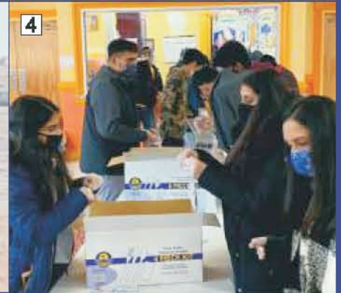
(1) Annakut Darshan of Thakorji in Los Angeles temple (America) on the occasion of 20th Patotsav. (2) Shakotsav Darshan in Auckland temple (New Zealand). (3) Group Photo of young devotees of our Karanchi temple (Pakistan) with symbol of Tilak Chandlo upon their T-shirts after winning an important match as champion and for that they were blessed by H.H. Shri Mota Maharaj. (4) Distribution of Utility Kits of meals during Corona period by Shree Swaminarayan temple, Sine Mansion (America)

For the facility and convenience of the devotees and Haribhaktas of Shree Swaminarayan Sampradaya residing in the country and abroad, online donations can be made through the following link of official website of Kalupur temple.