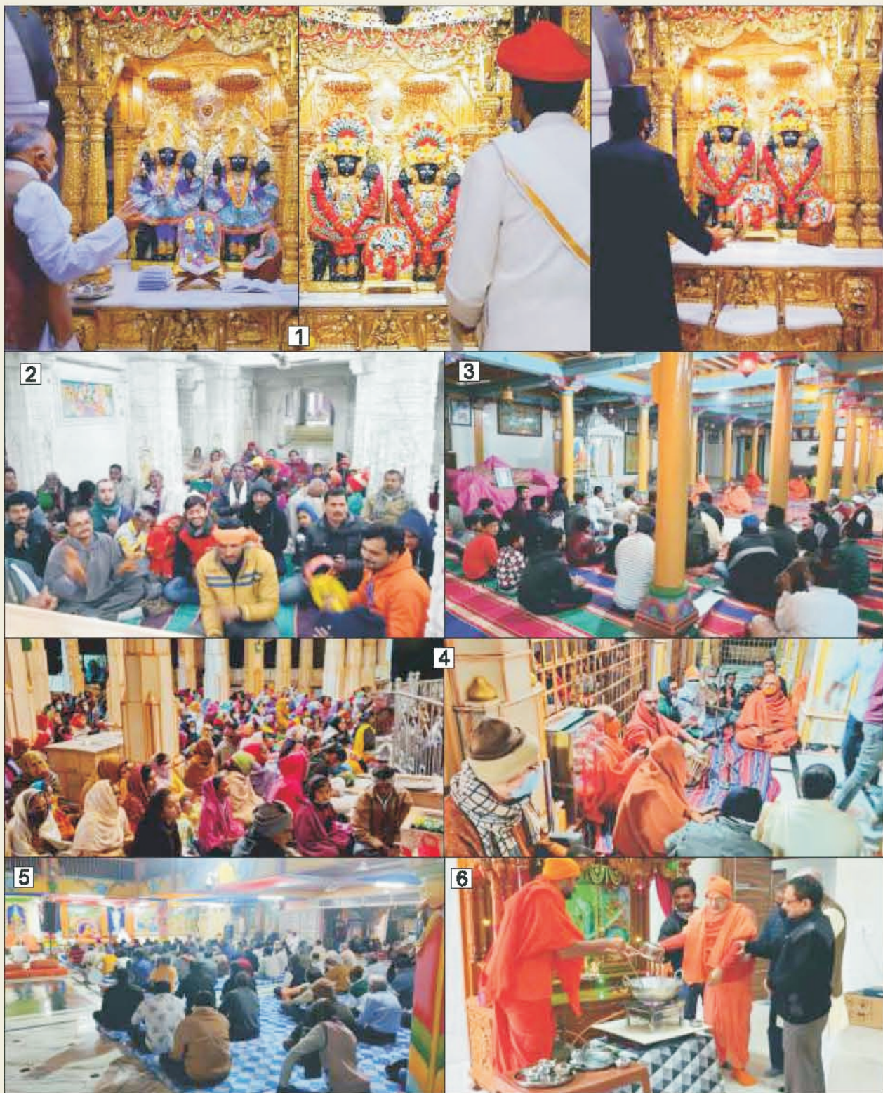
(1) All Other Three Forms of Shree Hari performing aarti of Thakorji in Kalupur temple during the pious Dhanur Maas. (2) Saints and Haribhaktas performing Dhoon during the pious Dhanur Maas in our Chhapaiya, Jetalpur, Muli and Naranpura temples, respectively. (3) Shakotsav in Shree Swaminarayan VishrantiBhuvan, Kota.