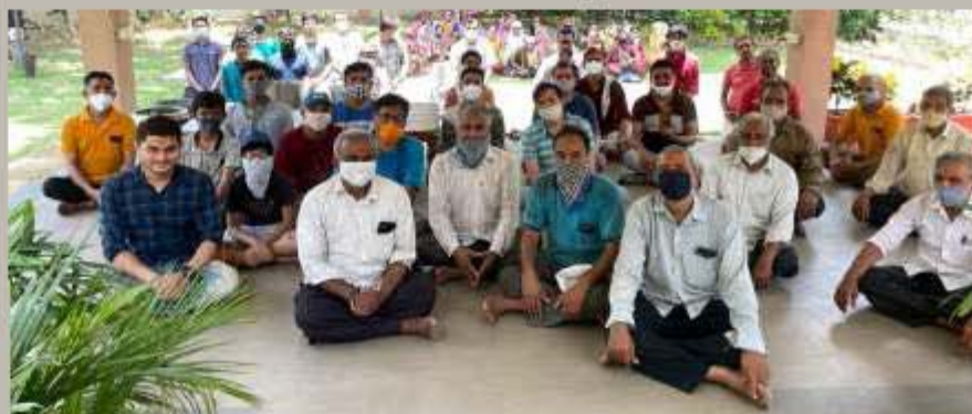
Haribhaktas rendering services for cleanliness and other services in Shree Swaminarayan Baug.