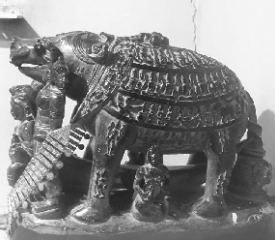
વરાહ ભગવાનની પ્રાચીન મૂર્તિ

blessings that they can perform His d i v i n e Darshan everyday. So Shreeji Maharaj gave the directions to get a beautiful