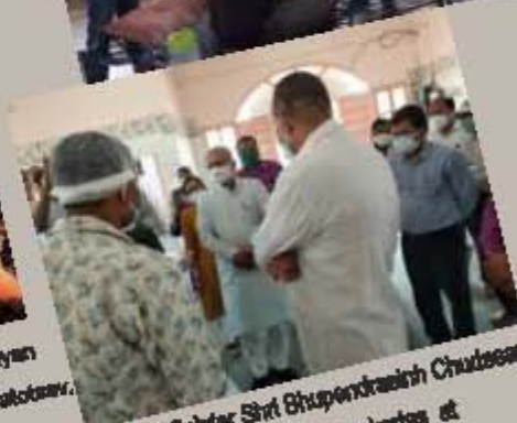
Hon'ble Minister Shri Bhupendraresh Chudasama having discussion with Karyakartas at Covid Centre at Vadu.