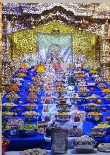
Annakut Darshan of Thakorji in Shree Swaminarayan temple, Chhapalya, on the occasion of Patotsav.