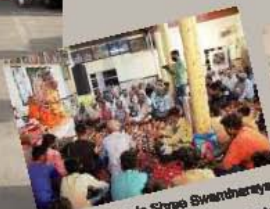
Sabang Sabha in Shree Swaminarayan temple, Motap on the occasion of Patotsav.