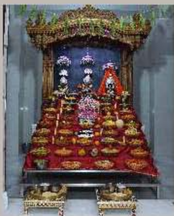
Annakut Darshan of Thakorji in Shree Swaminarayan temple, Merse, on the occasion of Patotsav.