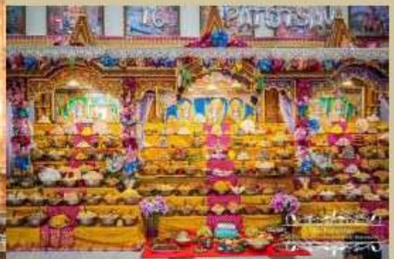
Annakut Darshan of Thakorji on the occasion of 16 th Patotsav of our temple in Sydney (Australia)