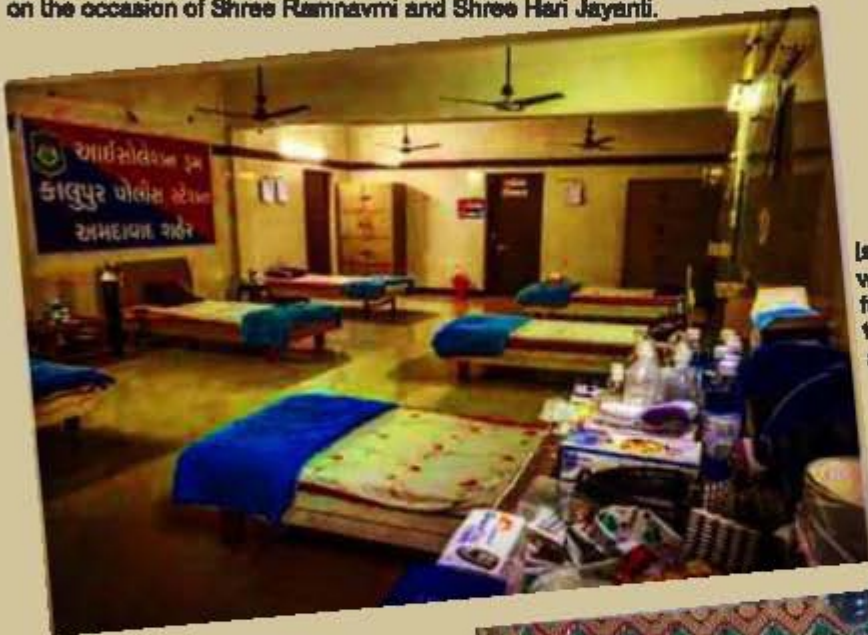
Isolation Rooms of 12 beds were made ready with oxygen facility in our Shree Swaminarayan temple, Kalupur for both gents and ladies police staff members.