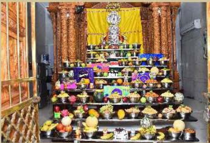
Annakut Darshan of Ghanshyam Maharaj in Akshar Bhuvan in Kalupur Shree Swaminarayan temple on the occasion of Shree Ramnavmi and Shree Hari Jayanti.