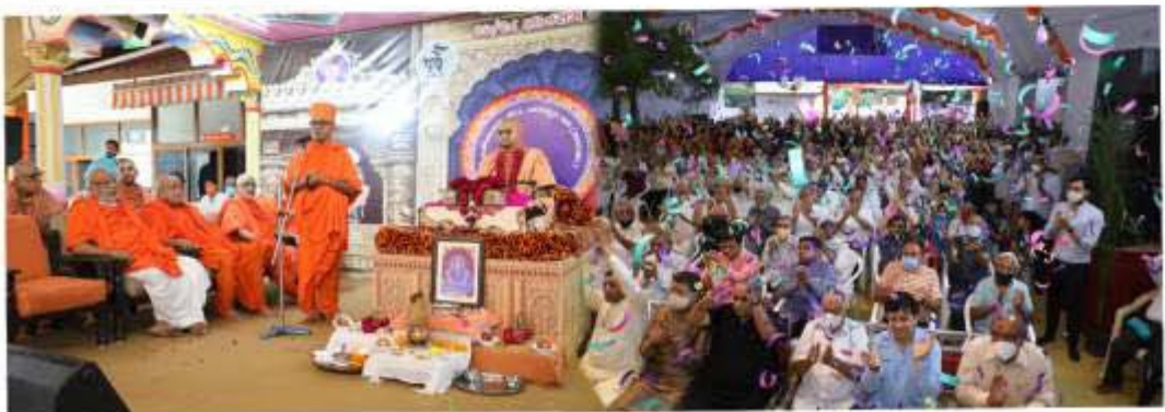
Gyan Sutra organized in Naranpura temple as a part of celebration of Parv Mahamahotsav