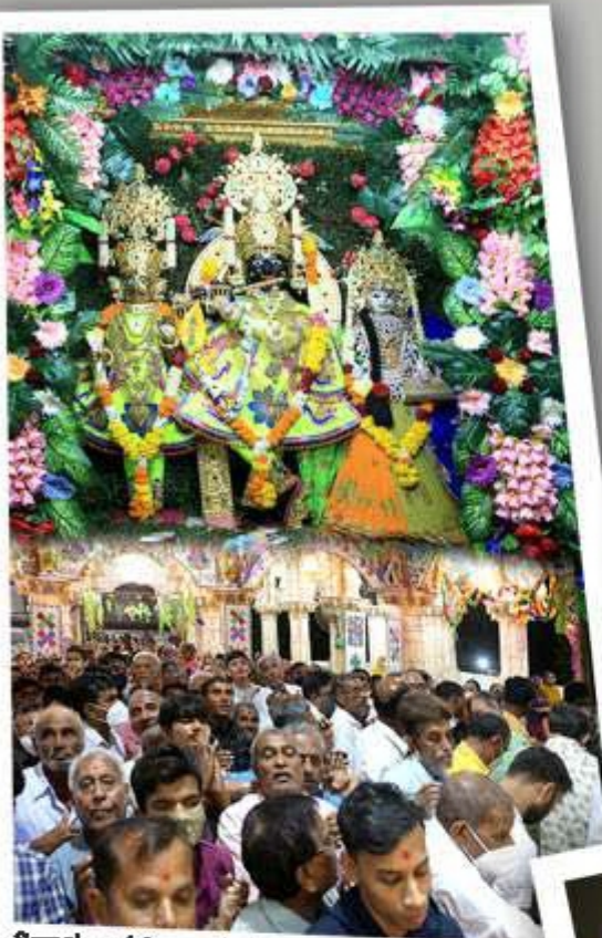
Samaroh of Janmashtmi in Mul temple