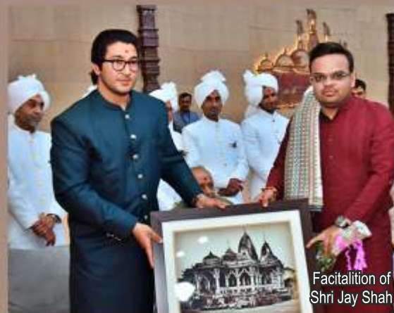
Facilitation of Shri Jay Shah