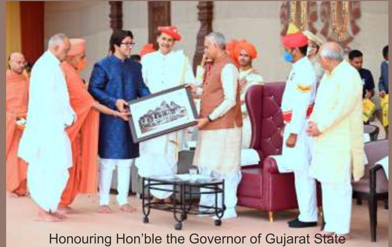
Honouring Hon'ble the Governor of Gujarat State

In the morning at 10.00 hours after Sthapan of Pothi