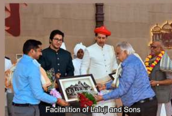
Facilitation of Lалуji and Sons