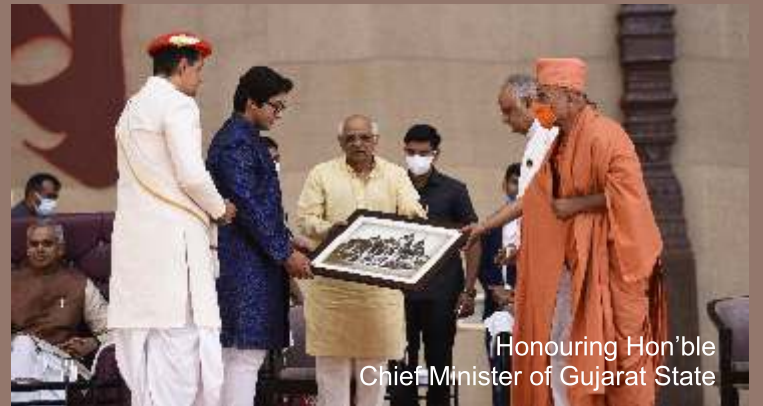
Honouring Hon'ble Chief Minister of Gujarat State