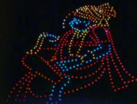
Historic Drone Show