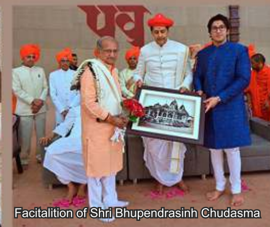
Facilitation of Shri Bhupendrasinh Chudasma