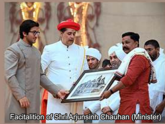
Facilitation of Shri Arjunsinh Chauhan (Minister)