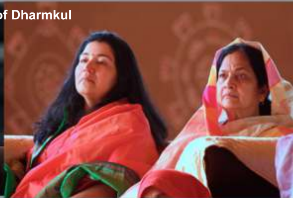
Guests of Dharmkul