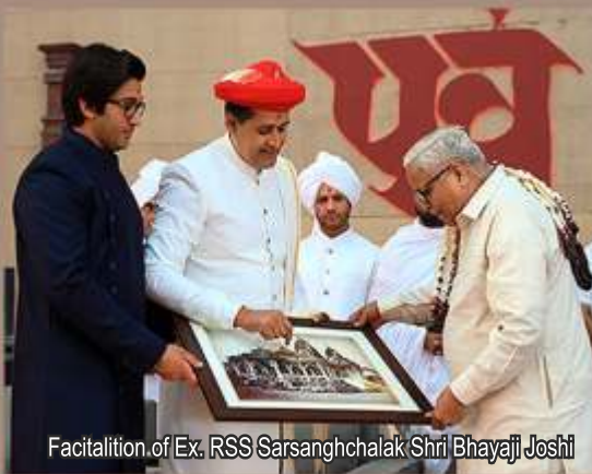
Facilitation of Ex. RSS Sarsanghchalak Shri Bhayaji Joshi