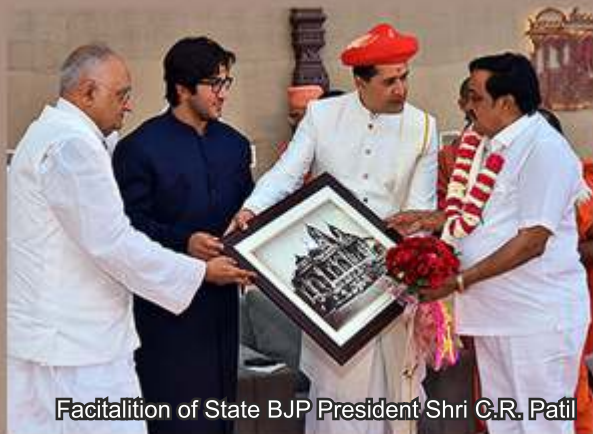
Facilitation of State BJP President Shri C.R. Patil