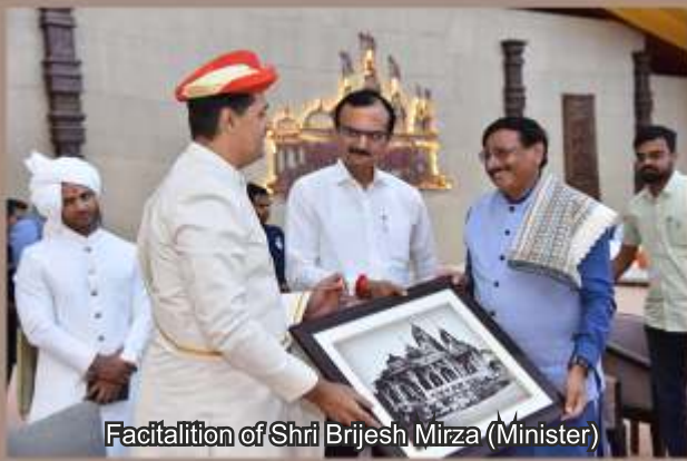
Facilitation of Shri Brijesh Mirza (Minister)