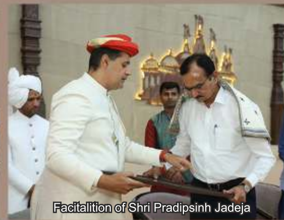
Facilitation of Shri Pradipsinh Jadeja