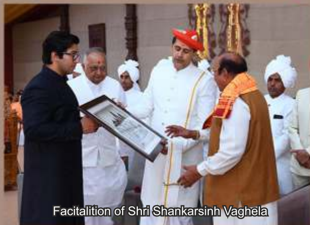
Facilitation of Shri Shankarsinh Vaghela