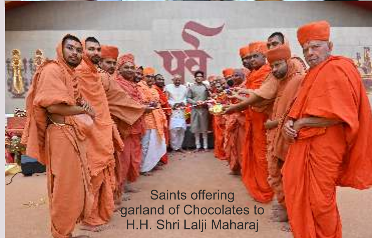
Saints offering garland of Chocolates to H.H. Shri Lalji Maharaj