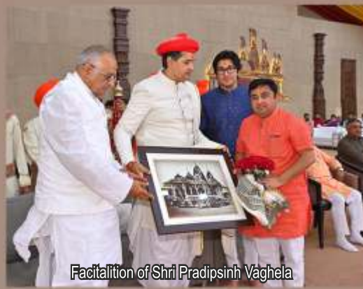
Facilitation of Shri Pradipsinh Vaghela