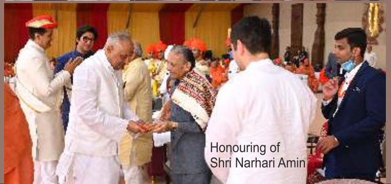
Honouring of Shri Narhari Amin