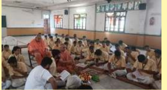
જેતલપુર આપણી સંસ્કૃત પાઠશાળામાં સમૂહ શ્લોક પઠન