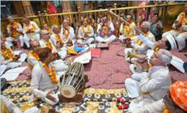
દેવપ્રબોધિની એકાદશીએ શ્રી નરનારાયણ દેવ સમક્ષ પરંપરાગત સંપૂર્ણ રાત્રી ઔચ્છવ કરતા હરિભક્તો