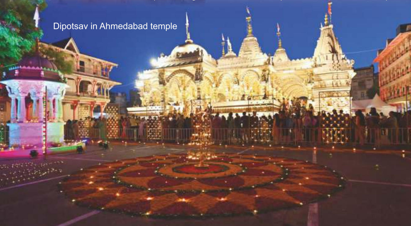
Dipotsav in Ahmedabad temple