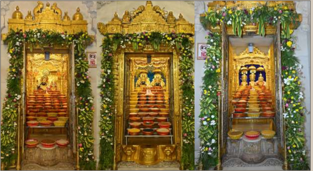
Annakut of grains was organized in Ahmedabad temple as an innovative measure and the grains of Prasad of Annakut was offered to the needy and poor persons.