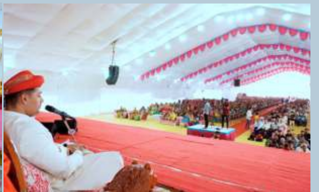
ધૂળકોટ (મૂળીપ્રદેશ) મંદિરના દસમાં પાટોત્સવ પ્રસંગે ઠાકોરજીની અન્નકૂટ આરતી ઉતારતા અને સભામાં આશીર્વાદ પાઠવતા પ.પૂ. આચાર્ય મહારાજશ્રી