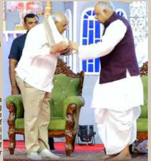
H.H. Shri Mota Maharaj honouring the Honourable the Chief Minister of Gujarat State Shri Bhupendrabhai Patel on the occasion of Memnagar Murti Pratistha.