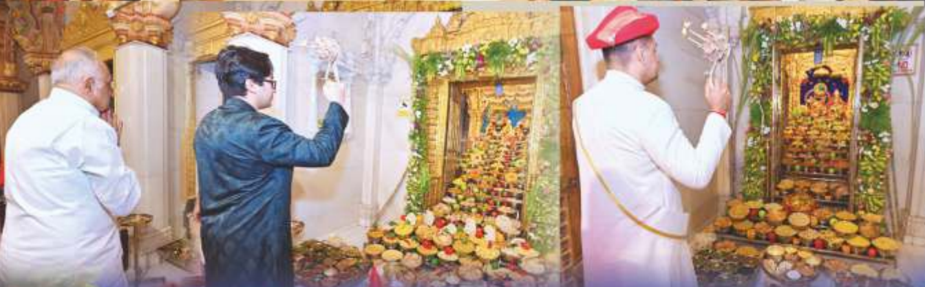
All three Other Forms of Shree Hari performing Annakut aarti of Deepawali in Ahmedabad temple.