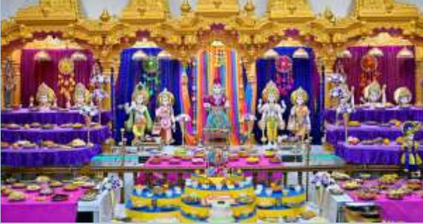
સાસ્કાટન (કેનેડા) અને નારણપુરા (અમદાવાદ) મંદિરમાં દિવાળી અન્નકૂટ દર્શન