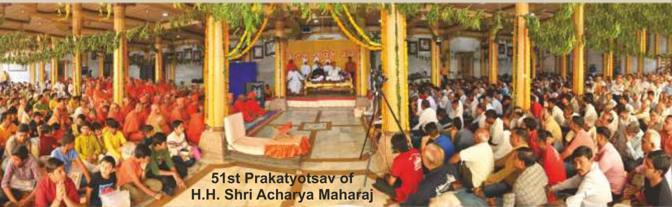
51st Prakatyotsav of H.H. Shri Acharya Maharaj

Registered under RNI - No - GUJENG/2007/20198 " Permitted to post at Ahd PSO on 11 the every month under postal Regd. No. GUJ. 582/2021-2023 issued SSP Ahd Valid up to 31-12-2023