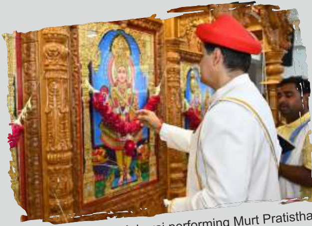
H.H. Shri Acharya Maharaj performing Murt Pratistha in Nutan Mandir at village Govindpara.