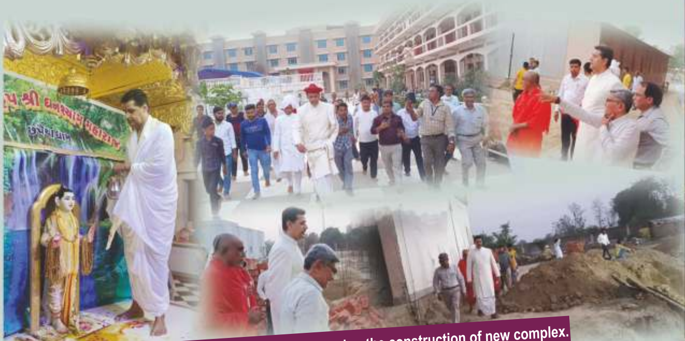
H.H. Shri Acharya Maharaj directly monitoring the construction of new complex.

Registered under RNI - No - GUJENG/2007/20198 " Permitted to post at Ahd PSO on 11 the every month under postal Regd. No. GUJ. 582/2021-2023 issued SSP Ahd Valid up to 31-12-2023