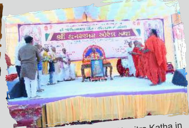
Shree Ghanshyam Bal Charitra Katha in Chhapaiya on the occasion of Patotsav.