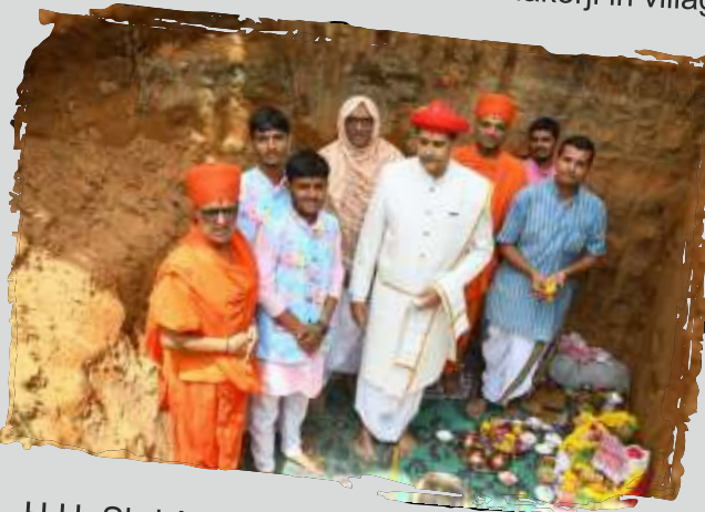
H.H. Shri Acharya Maharaj performing Khat Muhurt of Nutan Mandir at village Jaloya (Kapadwanj).