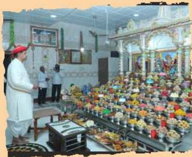
H.H. Shri Acharya Maharaj performing Annakut Aarti at village Rampara (MulDeesh).