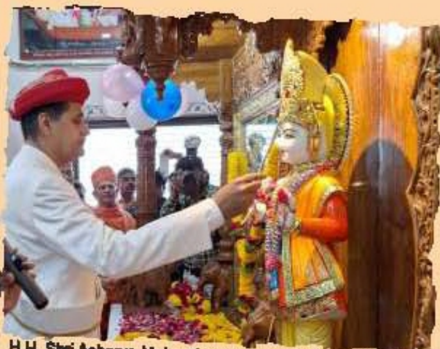
H.H. Shri Acharya Maharaj performing Murti Pratistha in Shree Swaminarayan temple, Khusela.