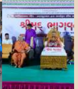
JaljilaniUtsav in Naranpura temple and devotees availing the benefit of listening to katha of RatriyaParayan.