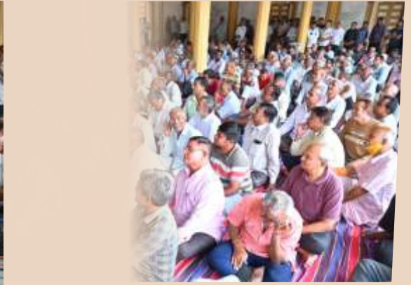
H.H. ShriAcharyaMaharaj and H.H. ShriLaljiMaharaj granting blessings in the Sabha being organized in Ahmedabad temple on every pious day of Poonam.