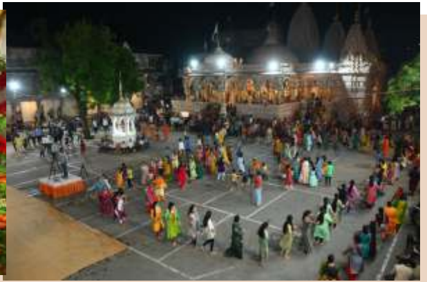
Krishna Janmotsavaarti and devotees performing Raas-Garba inChawk ofAhmedabad Kalupur temple on the pious day of Janmastmi.