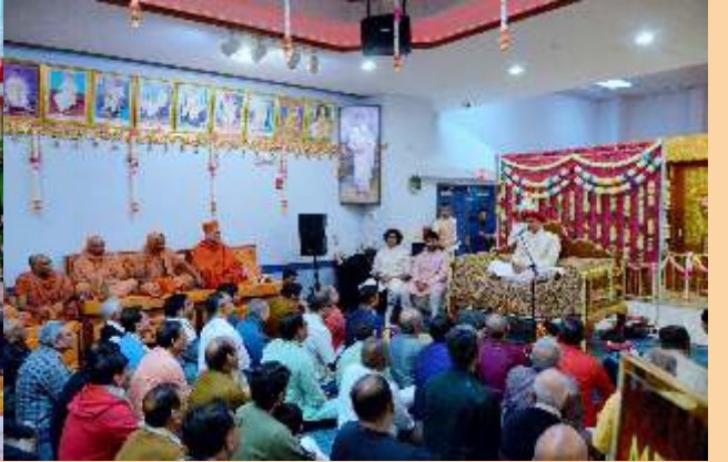
કોલોનિયા(અમેરિકા) મંદિરમાં ઠાકોજીની આરતી ઉતારતા તથા સભામાં આશીર્વાદ આપતા પ.પૂ. આચાર્ય મહારાજશ્રી