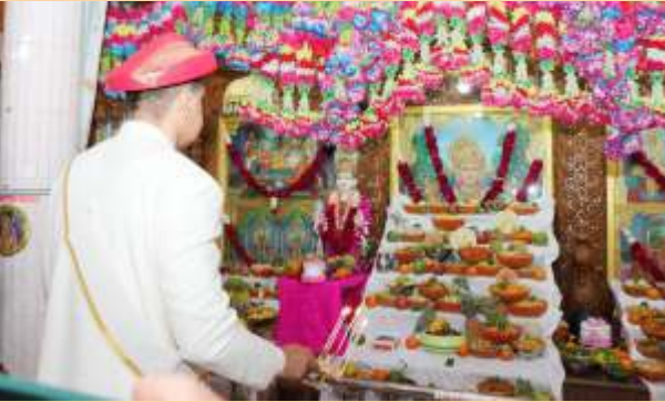
બાકરોલ મંદિરના ૧૬માં પાટોત્સવ પ્રસંગે ઠાકોરજીની અન્નકૂટ આરતી ઉતારતા અને સભામાં આશીર્વાદ આપતા પ.પૂ. આચાર્ય મહારાજશ્રી