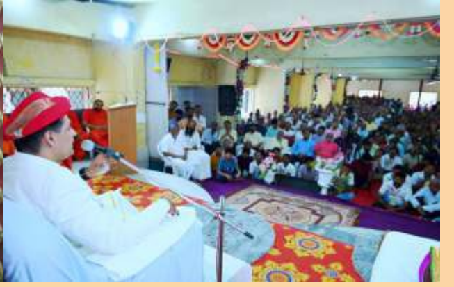
કાંકરિયા મંદિરના પાટોત્સવ પ્રસંગે બાળ સ્વરૂપ હનુમાન દાદાનો અભિષેક કરતા અને સભામાં આશીર્વાદ આપતા પ.પૂ. આચાર્ય મહારાજશ્રી