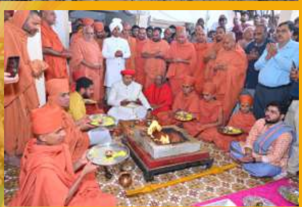
202nd Patotsav of Shree Narnarayandev in Kalapur temple and H.H. ShriAcharyaMaharaj offering Saint Mahadikshaon the occasion of Patotsav.