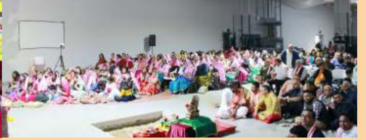
સીનસીનાટી (અમેરિકા) નૂતન મંદિરનું ખાત મૂર્છત કરતા પ.પૂ.આચાર્ય મહારાજશ્રી અને દર્શનનો લાભ લેતા હરિભક્તો