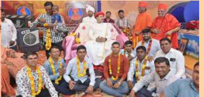
ચરાડવા મંદિરના પાટોત્સવ પ્રસંગે ઠાકોરજીની અન્નકૂટ આરતી ઉતારતા અને સભામાં યજમાન પરિવાર સાથે પ.પૂ. આચાર્ય મહારાજશ્રી