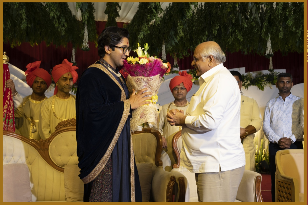
Honourable Shri Bhupendrabhai Patel Chief Minister of the Gujarat State conveying wishes to H.H. Shri Lalji Maharaj.