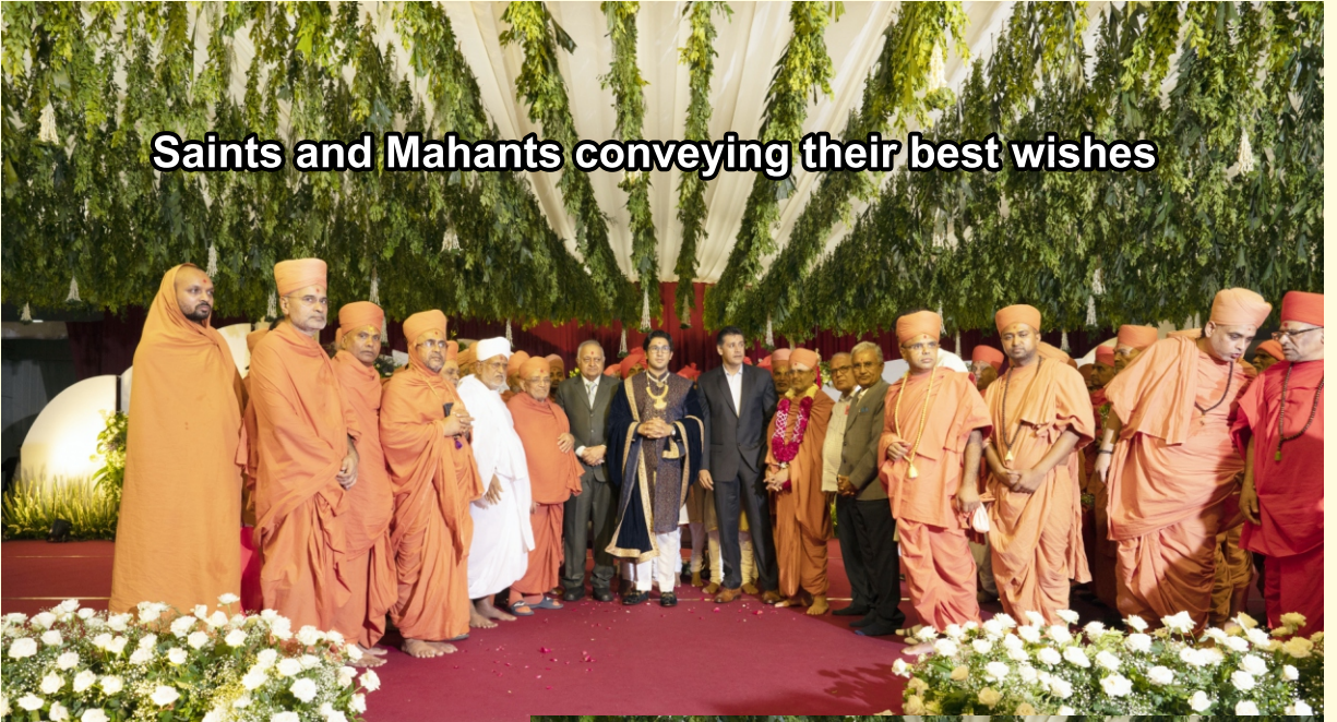
Saints and Mahants conveying their best wishes