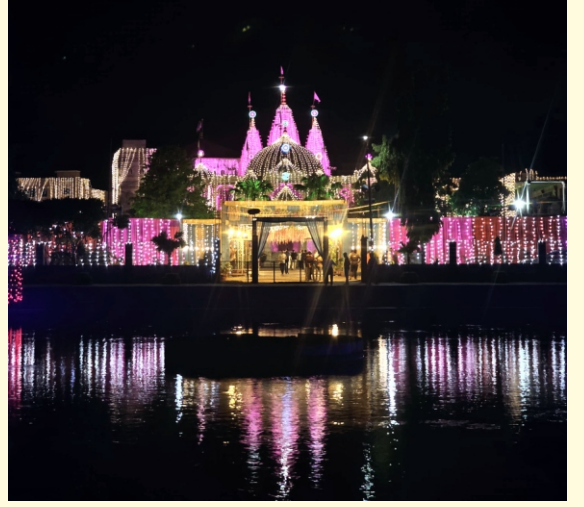
Narayan Sarovar, Chhapaiya decorated with lightening

Enthusiasm and pleasure of Father and son : all Three Other Forms of Shree Hari were inspiring all wearing clothes suitable to the occasion. There has been always natural joy and pleasure in the life of