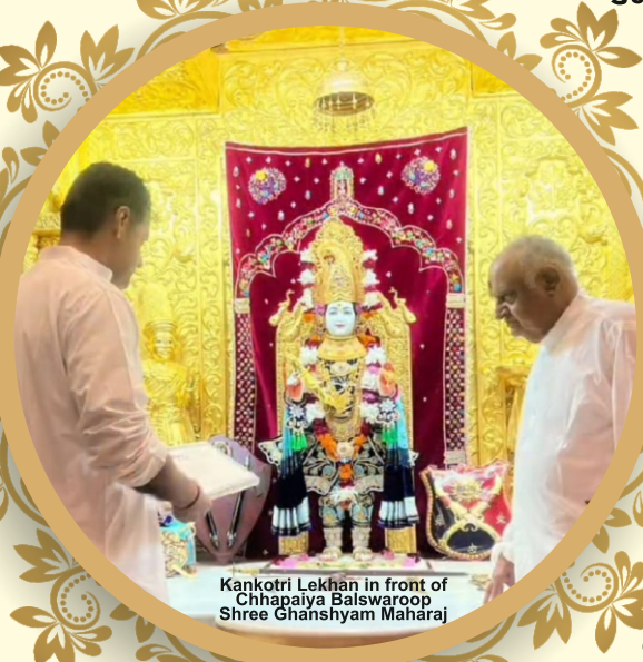
Kankotri Lekhan in front of Chhapaiya Balswaroop Shree Ghanshyam Maharaj

It was decided to celebrate all pre-wedding ceremonies and functions at in the pious company of the deities at Chhapaiyadham which is Home of