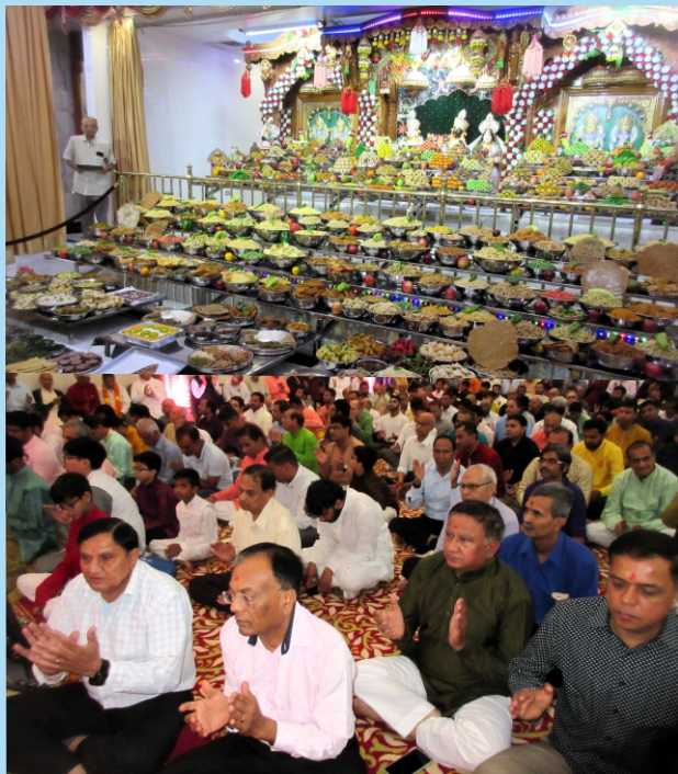
Annakut Darshan in Chicago (America) temple