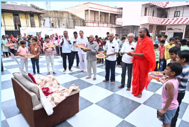
Celebration of Guru Purnima in Unava temple