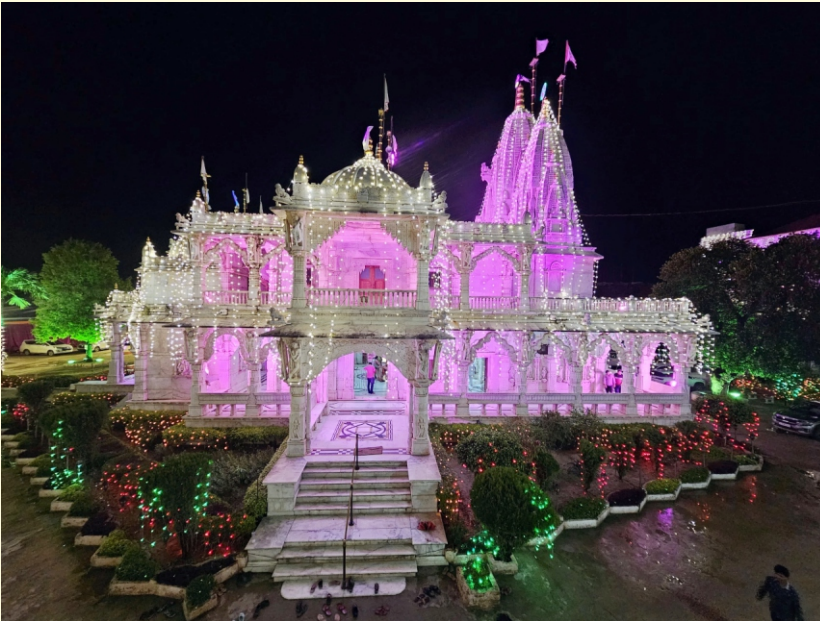
Chhapaiya temple decorated with lightening

In Prayagraj on this pious wedding ceremony occasion the persons who performed divine Darshan of Dharmakul are very