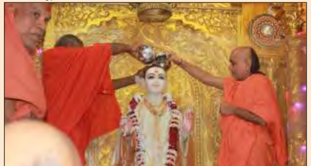
પ્રયાગ મંદિરમાં પાટોત્સવ પ્રસંગે ઠાકોરજીના અભિષેક દર્શન