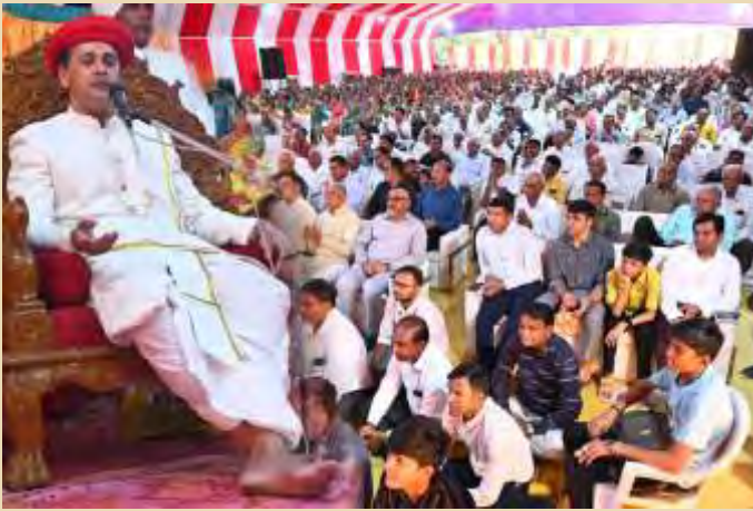
H.H. Shri Acharya Maharaj granting blessings in Katha organized at village Motipura.