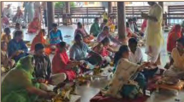
જેતલપુર મંદિરમાં સમૂહ મહાપૂજામાં લાભ લેતા હરિભક્તો