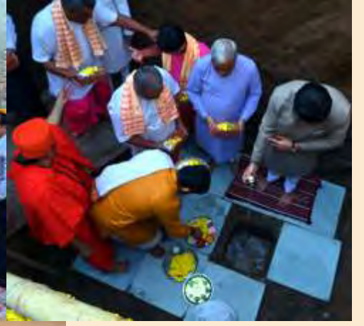
અમદાવાદ કાલુપુર મંદિરમાં શ્રી નરનારાયણદેવ આદિ દેવોના અઘતન રસોડાનું ખાત મુર્દૂત પ્રસંગે શ્રી હરિના ત્રણેય અપર સ્વરૂપો