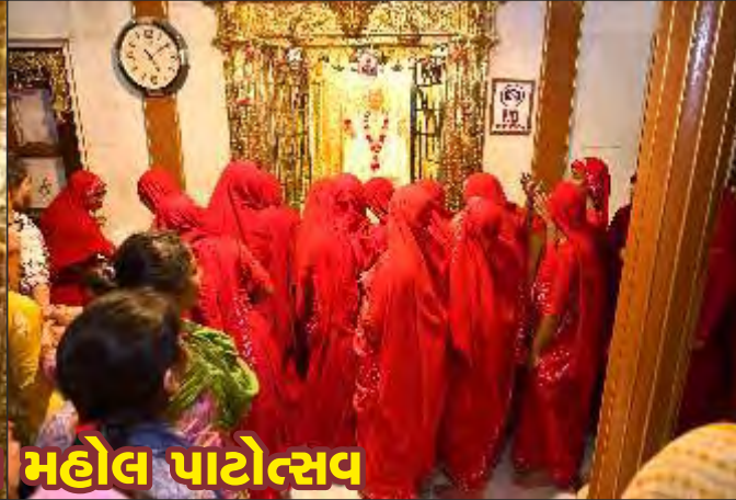
રંગ મહોલ પાટોત્સવ