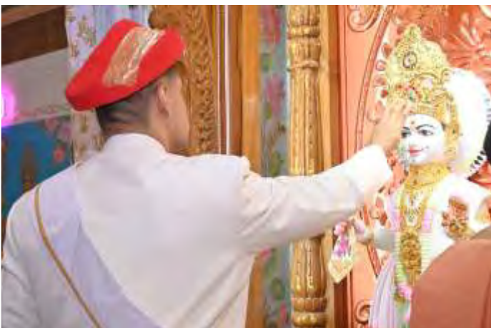
H.H. Shri Acharya Maharaj performing Murti Pratistha in Modpar (Kutch) temple.