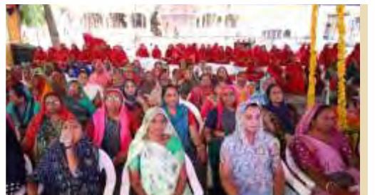
Haribhaktas of Mandvi (Kutch) had organized Shrimad Satsangibhushan Parayan in Ahmedabad temple.