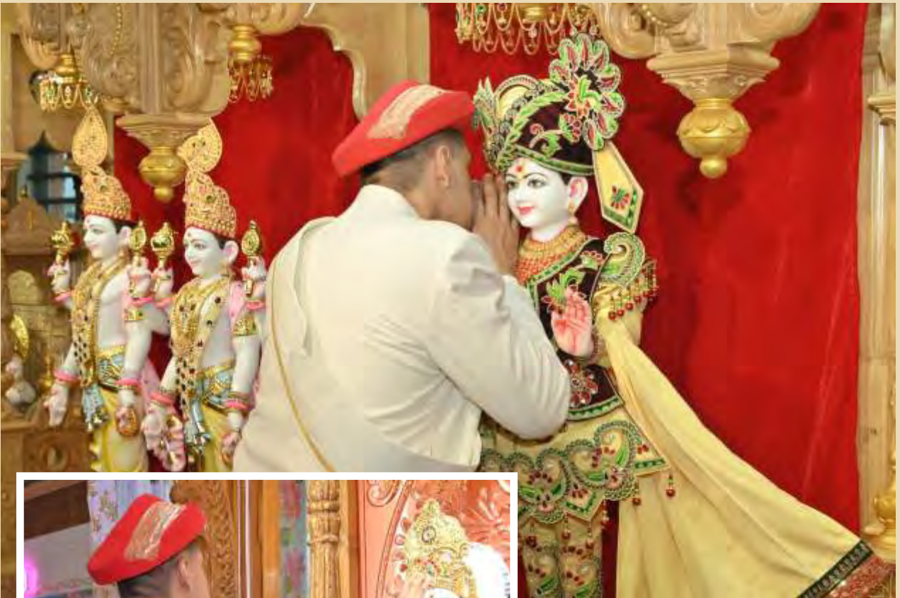
H.H. Shri Acharya Maharaj performing Murti Pratistha in Golden City (Kutch) temple.