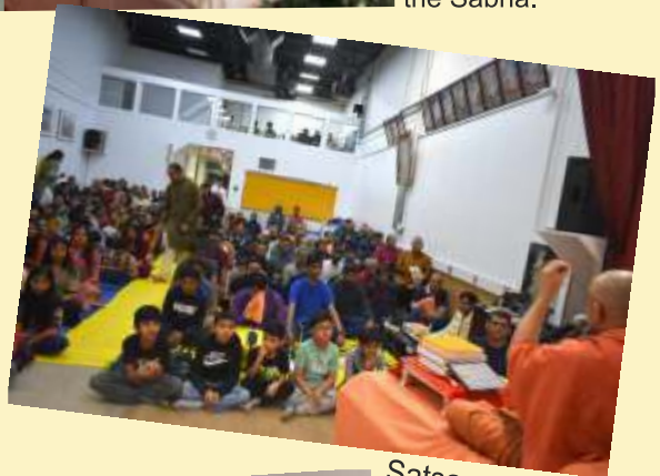
Satsang Sabha in Saskatoon temple (Canada).