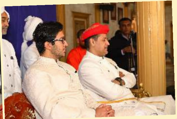
Divine Darshan of Other Three Forms of Shree Hari in the Sabha of Poonam in Kalupur temple, Ahmedabad.