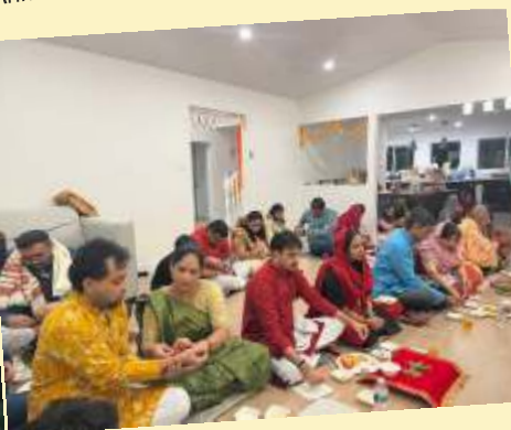
Shakotsav and Samuh Mahapooja in Vancouver temple (Canada).