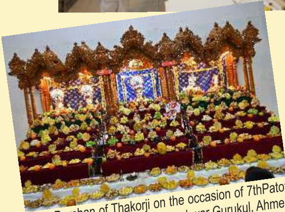
Annakut Darshan of Thakorji on the occasion of 7th Patotsav of Shree Swaminarayan temple, Koteswar Gurukul, Ahmedabad.