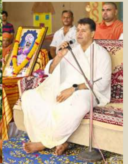
ધોળકા મંદિરના ૧૯૭ માં પાટોત્સવ પ્રસંગે ઠાકોરજીની આરતી ઉતારતા અને સભામાં આશીર્વાદ આપતા પ.પૂ.આચાર્ય મહારાજશ્રી