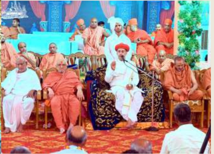
H.H. Shri Acharya Maharaj performing Abhishek of Thakorji and granting blessings in the Sabha alongwith Mahant Swami of Bhuj temple and ParshadJadavji Bhagaton the occasion of 14th Patotsav of Bhuj temple of Prasadi.