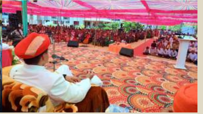
માણસા મંદિરનાં પાટોત્સવ પ્રસંગે ઠાકોરજીની આરતી ઉતારતા અને સભામાં આશીર્વાદ આપતા પ.પૂ. આચાર્ય મહારાજશ્રી