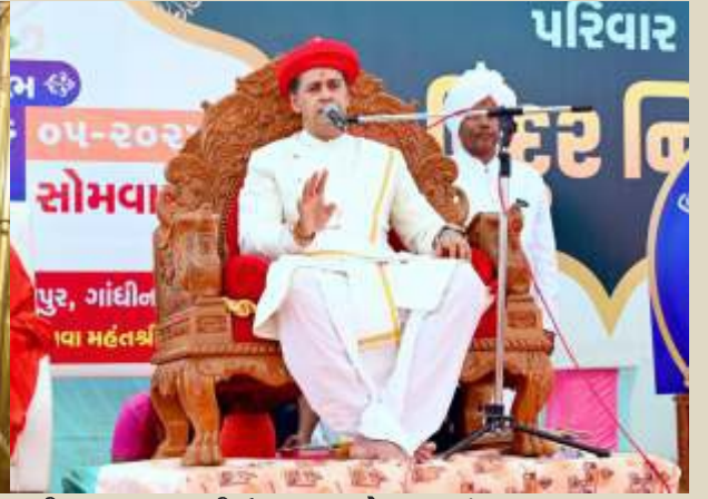
ઉનાવા મંદિરના ૪૨ માં પાટોત્સવ પ્રસંગે ઠાકોરજીની અન્નકૂટ આરતી ઉતારતા અને સભામાં આશીર્વાદ આપતા પ.પૂ. આચાર્ય મહારાજશ્રી