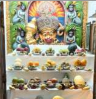
શ્રી હનુમાન જયંતીના આપણા અસારવા ગુરુકુળમાં વીર હનુમાનજી સમક્ષ માર્તિ યજ્ઞ તથા સુંદરકાંડના પાઠનું સુંદર આયોજન કરાયું હતું