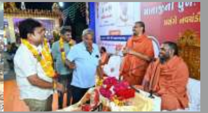
ગાંધીનગર સેક્ટર -૨મંદિરના રજત જયંતી મહોત્સવના ઉપલક્ષમાં રાત્રી સત્સંગ સભામાં સત્સંગ કરાવતા સંતો ધમાસણા ગામે કથા પારાયણ