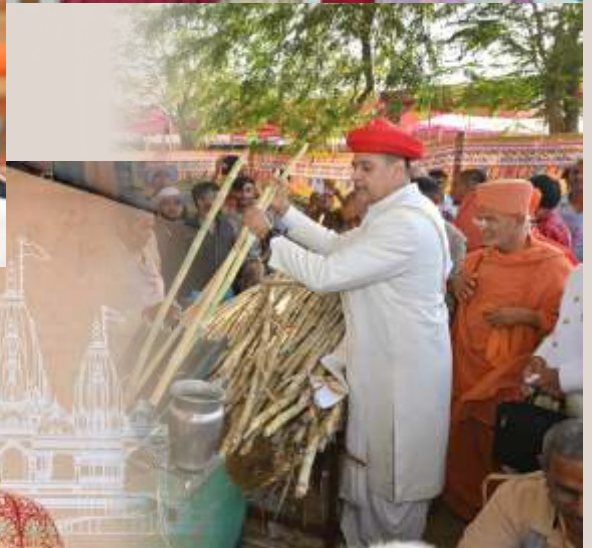
Photographs of Pratistha Mahotsav of Radhakrishnadev in Nutan Mandir of Anjar (Kutch)