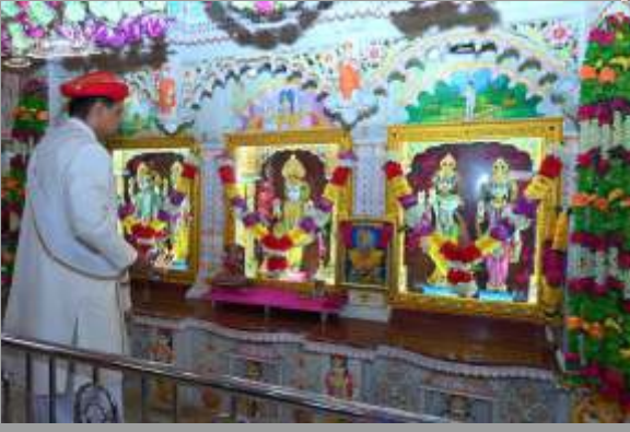
અમારા (કચ્છ)મંદિરના પાટોત્સવ પ્રસંગે ઠાકોરજીની આરતી ઉતારતા પ.પૂ. આચાર્ય મહારાજશ્રી