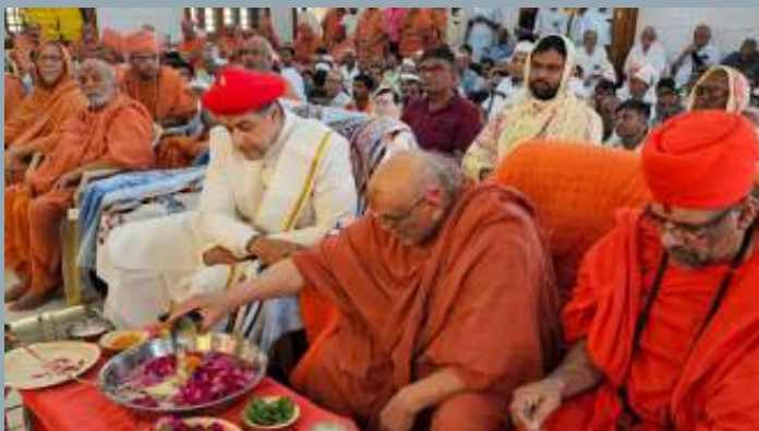
H.H. ShriAcharyaMaharaj performing MurthiPratistha in Chobari (Kachchh) temple and Mahant Swami of Bhuj temple.