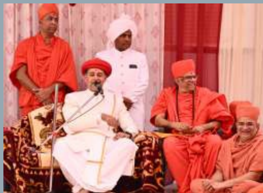
H.H. ShriAcharyaMaharaj granting blessings in SatsangSabha organized in Ranip temple.