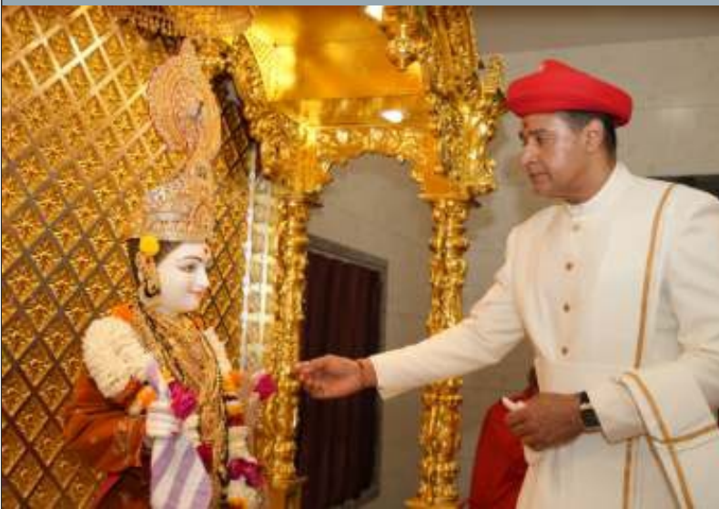
H.H. ShriAcharyaMaharaj performing MurthiPratistha in Jaipur (Bagru) NutanMandir and VishrantiBhuvan.