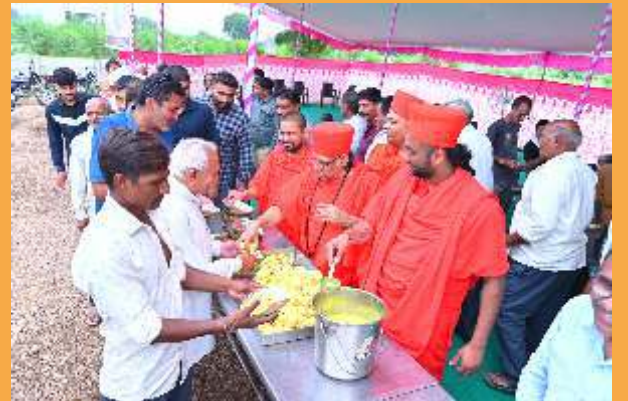
સમૈયાના ઉપલક્ષમાં અંબાજી પદયાત્રીઓ માટે ભોજન કેમ્પને ખુલ્લો મુક્તા અમદાવાદ મંદિરના મહંત સ્વામી તથા સંતો