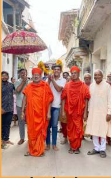
વડનગર મંદિરમાં શ્રી ગણપતિજીના વરઘોડાના દર્શન