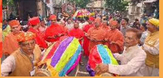
પ.પૂ.લાલજી મહારાજશ્રીની નિશ્રામાં અમદાવાદ મંદિરમાં તથા નારણઘાટ મંદિરમાં જલજીલણી ઉત્સવ