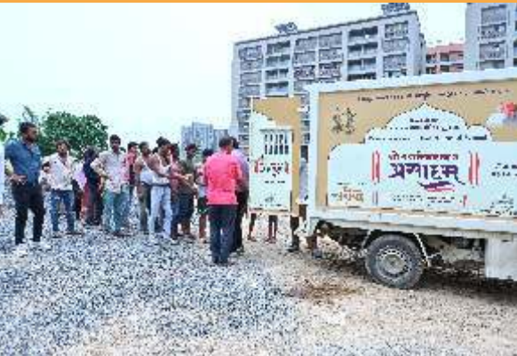
સમૈયાના ઉપલક્ષમાં “પ્રસાદમ” દ્વારા કોટેશ્વર ગુરુકુળમાં ચાલતી પ્રવૃત્તિ