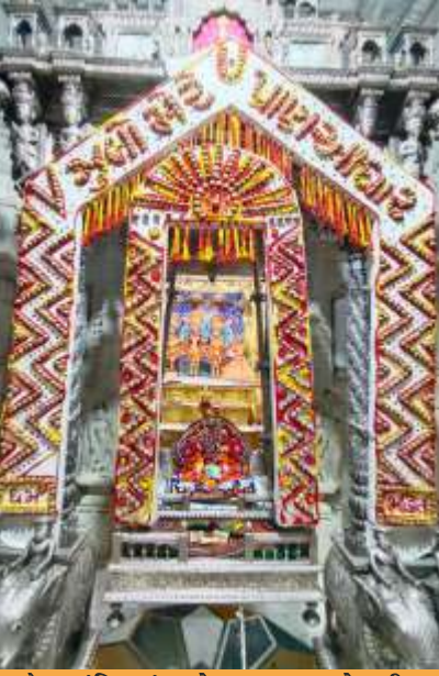
છપૈયા મંદિરમાં ઠાકોરજી સમક્ષ સોપારી-નાડાછડીના હિંડોળા દર્શન