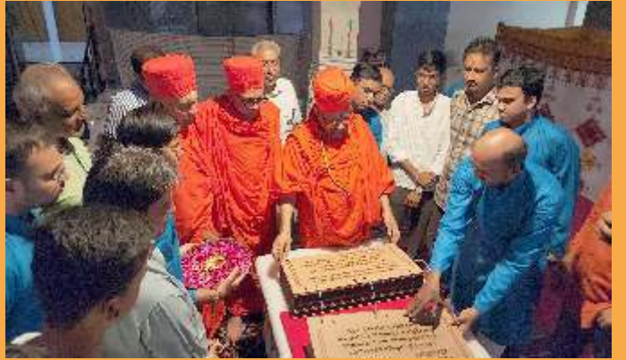
નવા વાડજ મંદિરમાં સમૈયાના ઉપલક્ષમાં હરિભક્તો દ્વારા બનાવાયેલ શિક્ષાપત્રી નિહાળતા અમદાવાદ મંદિરના મહંત સ્વામી