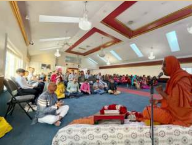
Haribhaktas availing the benefit of Katha-Varta in Vancouver (Canada).