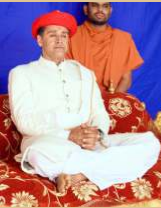
H.H. Shri Acharya Maharaj granting blessings in the Sabha of Poonam being organized in Kalupur temple on every pious day of Poonam.