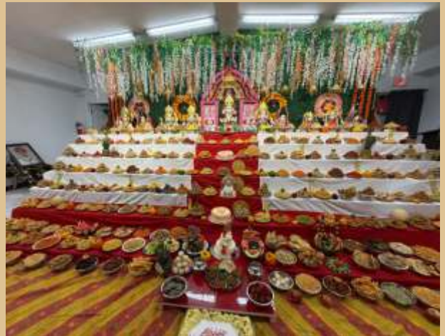
Annakut Darshan of Thakorji on the occasion of Patotsav of Rajaina (Canada) temple.