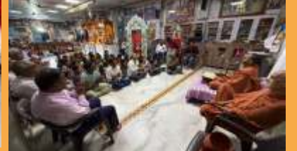
બિલોદરા મંદિરમાં સમૈયાના ઉપલક્ષમાં સત્સંગ સભા