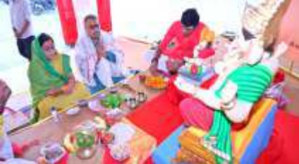
અમદાવાદ મંદિરમાં ગણેશ ચતુર્થી ઉત્સવ