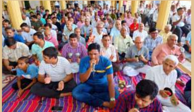
Akhand Dhoon was organized in Kalupur temple for Kalyan of the departed souls of the persons who lost their lives in an air-plane crash accident in Ahmedabad.