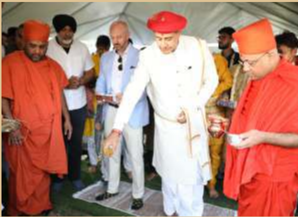
H.H. Shri Acharya Maharaj performing Khat Muhurt of Nutan temple with dome at Toronto (I.S.S.O. Canada).